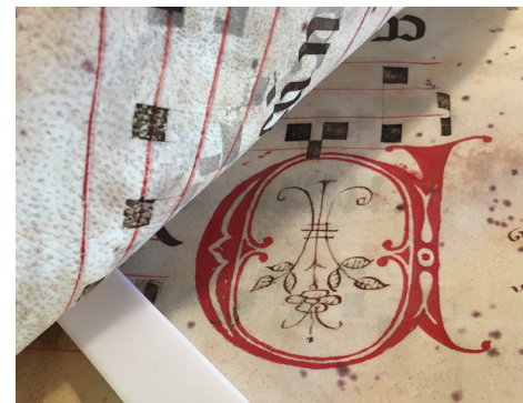
One of 60 decorated initials in the Graduale that has been conserved.

is being tested with nanostructured organic consolidant that could bring flexibility and firmness back to the parchment. If the results of tests are good, the treatment could allow a full recovery of the deteriorated parchments of the Kyriale.