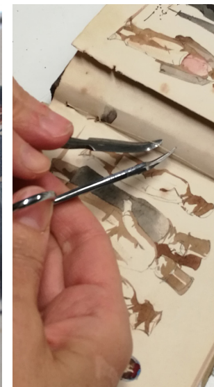
Opposite: Resewing a torn page. Hemp cord sewing supports.