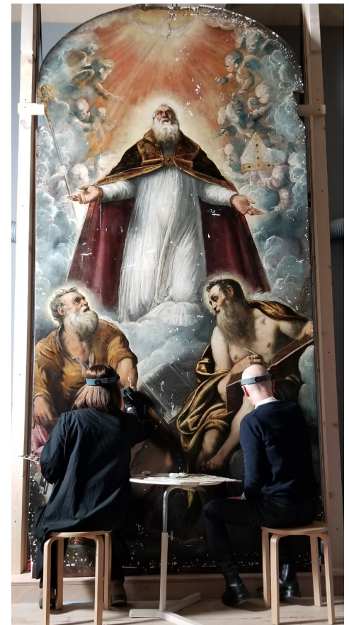
Robusti, Jacopo, called Tintoretto, San Marziale, during conservation undertaken by Silvia Bonifacio and Giulio Bono, funded by SAVE Venice Inc.

Opposite: Robusti, Jacopo, called Tintoretto, Miracle of the Slave , oil on canvas, 416 x 544cm