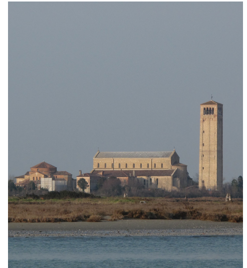
The Cathedral of Torcello

The feature that sets the Torcello iconostasis apart from its eastern cognates, however, is its superb painted image beam. Added probably around 1420-30, it has been convincingly