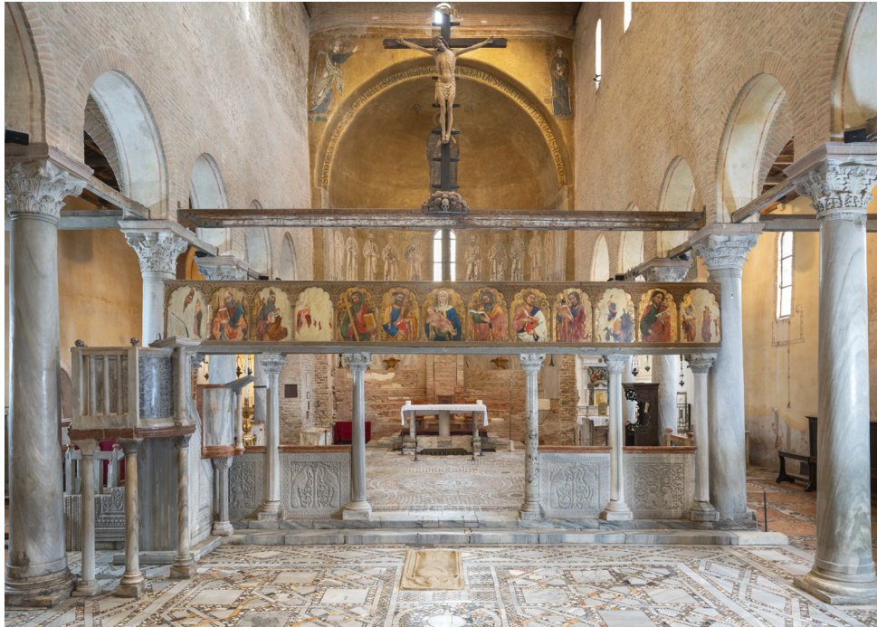
Above: The stonework structure and the 13 tempera panels of the Iconostasis will be conserved. Cover: The central panel showing the Virgin and Child. Both reproduced by kind permission of the Patriarchate of Venice – Torcello Photo: Matteo De Fina

You can donate by sending a cheque made out to Venice in Peril (JJN) or online at www.veniceinperil.org or tel. 020 7736 6891